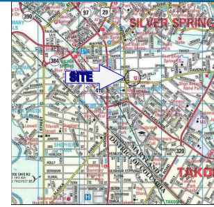
LOCATION MAP PERMIT USE NO. 00001513-9 SCALE: 1"=200'